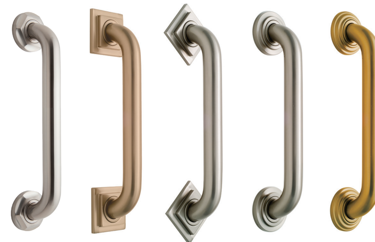
Contemporary Hex Flanges (Astor) 29

The Deluxe Grab Bar Series is constructed of 1-1/4" O.D. brass tubing/flanges and are ADA-Compliant when properly installed. Standard sizes are: 12", 16", 18", 24", 32", 36" 42" and 48" and available in 26+ finishes.