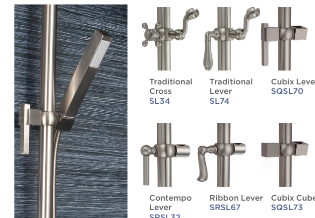
Traditional Cross SL34