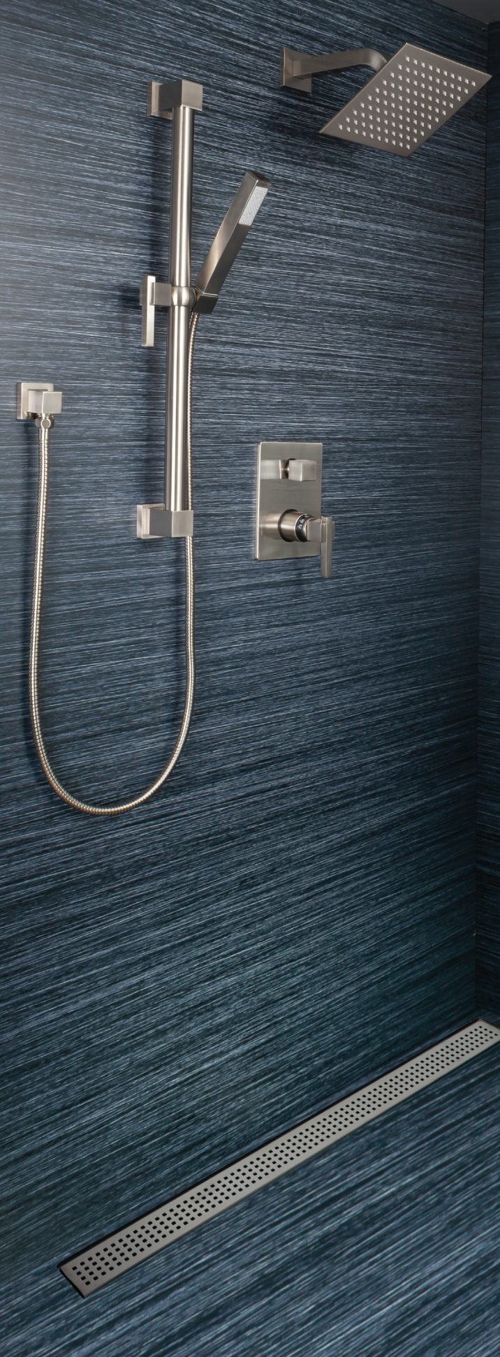
Luxurious complete JACLO compliant shower system with JACLO channel drain.