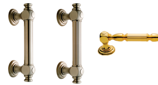
Smooth w/ End Caps H60