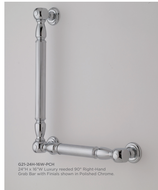
G21-24H-16W-PCH 24"H x 16"W Luxury reeded 90° Right-Hand Grab Bar with Finials shown in Polished Chrome.